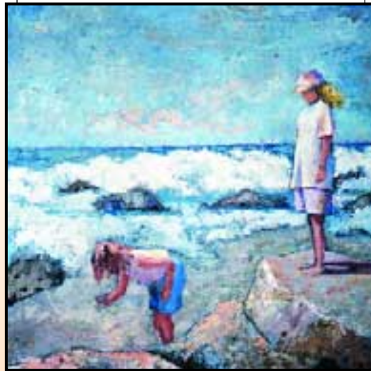
"Adventure on the High Sea"